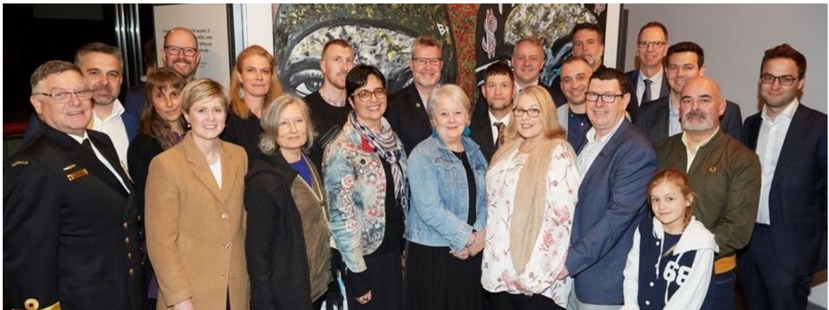
ANVAM team at the launch of Changed Forever