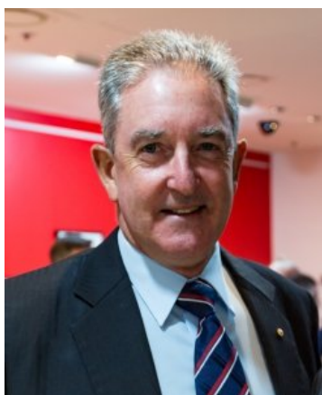
LTGEN Ash Power AO CSC (Rtd)