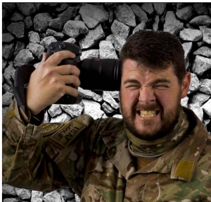
Chris Moore, Photocide , 2016 (detail)