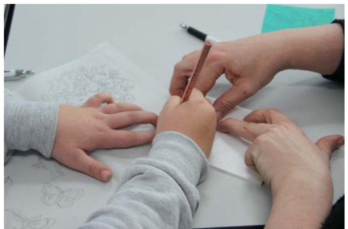
Mother and daughter making art together

ANVAM was very proud to continue its collaboration with Legacy Melbourne as a strategic partner with the emphasis on families. The family focussed art program that kicked off in 2017 continued throughout 2019. These programs will continue again in 2020.