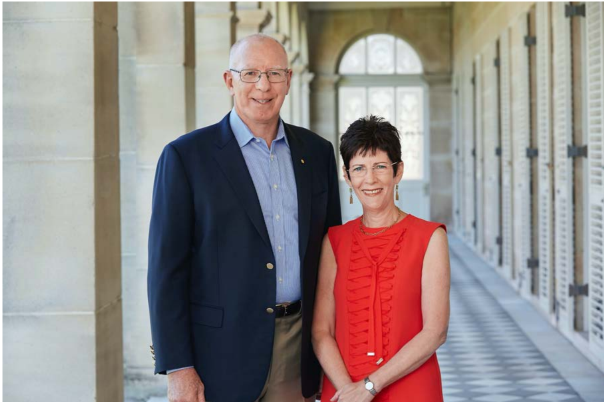
His Excellency General the Honourable David Hurley AC DSC (Retd) and Her Excellency Mrs Linda Hurley